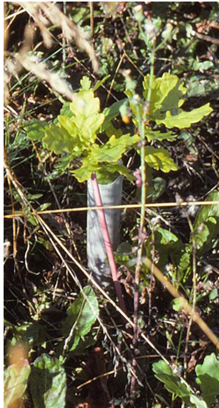
Figure 1. A pedunculate oak seedling ( Quercus robur L.) emerging from a prototype “seed tube” designed to protect seed from depredation and provide a favorable microenvironment to the germinant.

rate of stand development (Grossnickle and Ivetić 2017). This is notably the case for species with seed traits that render them problematic for seeding, such as some light-seeded species and those with seed that show dormancy, sensitivity to desiccation, poor storage, or high susceptibility to depredation (Figure 1). Poor establishment success and relatively slow stand development also materialize when seeding high productivity sites with unchecked growth of competing vegetation. Indeed, issues like seed depredation and competing vegetation led 17 th century English practitioners to concentrate seeding in small “garden” areas adjacent to the regeneration site where the effort could be protected and tended to produce seedlings for transplanting (Harmer and Kerr 1995). While early and present-day research advances have addressed some of the issues mentioned above, particularly for a locale or a region, many remain easier to overcome in a seedling nursery setting rather than a field setting.