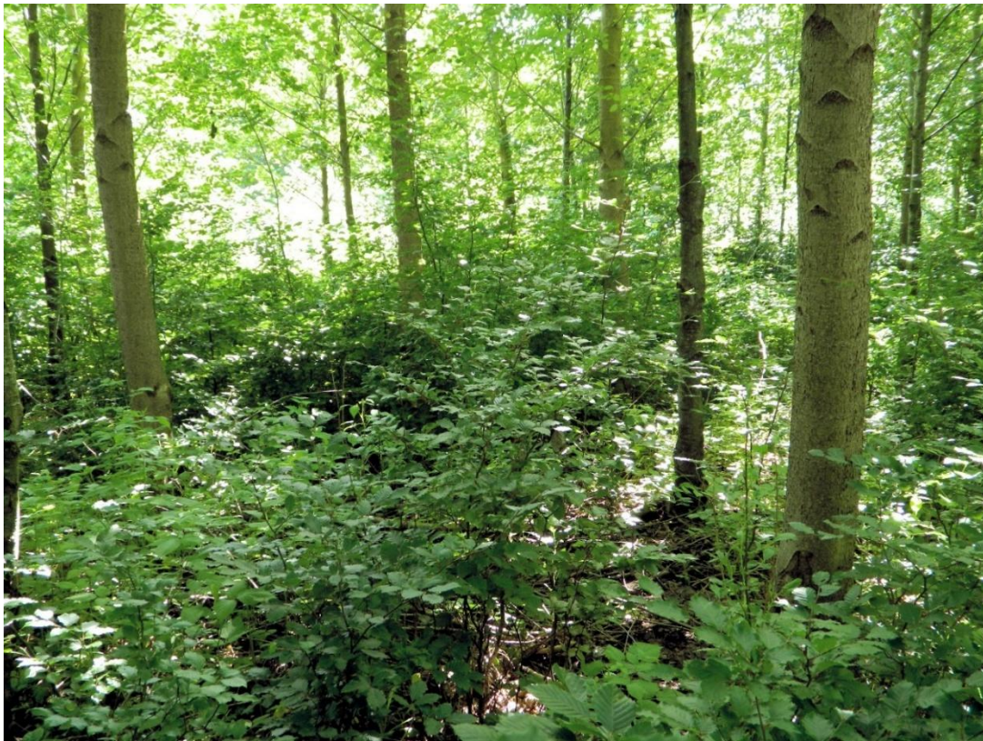
Figure 3. European beech ( Fagus sylvatica L.) seeded beneath a poplar ( Populus spp. L.) plantation established on former agricultural land. This practice can be used to enrich fast-growing plantations with desired slower-growing species and increase forest structure complexity in forest restoration settings.